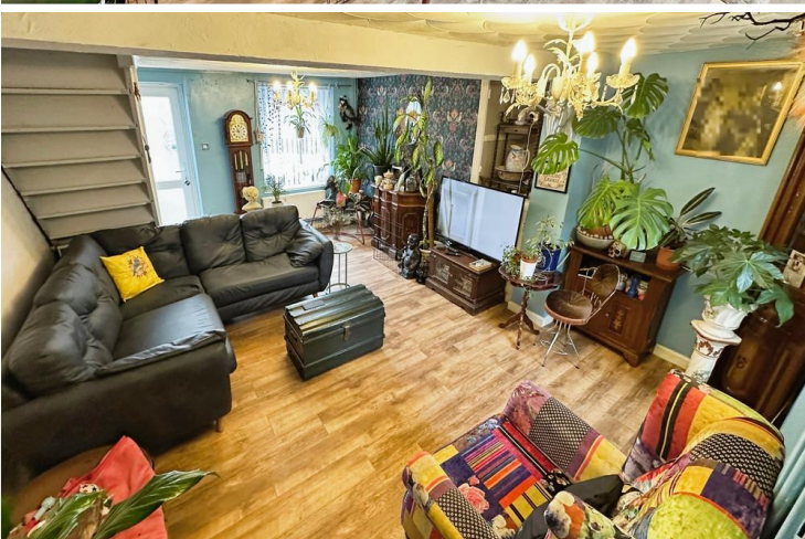
11 Merthyr Road | Glynneath | Neath | SA11 5LR